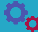
ENGINEERING AND MANUFACTURING