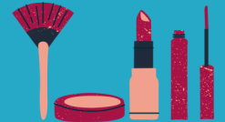
HAIR & BEAUTY