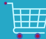
SALES, MARKETING & PROCUREMENT