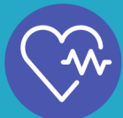
HEALTH & SCIENCE