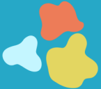
CREATIVE & DESIGN