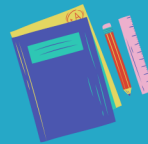
EDUCATION AND CHILDCARE